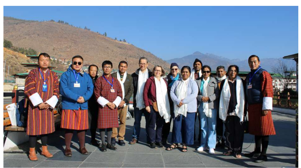
1<sup>st</sup> Batch (Participants from Gemany, Portugal & Sri Lanka) Arrival Reception at Paro Airport

Some of the pictural report of the meeting: