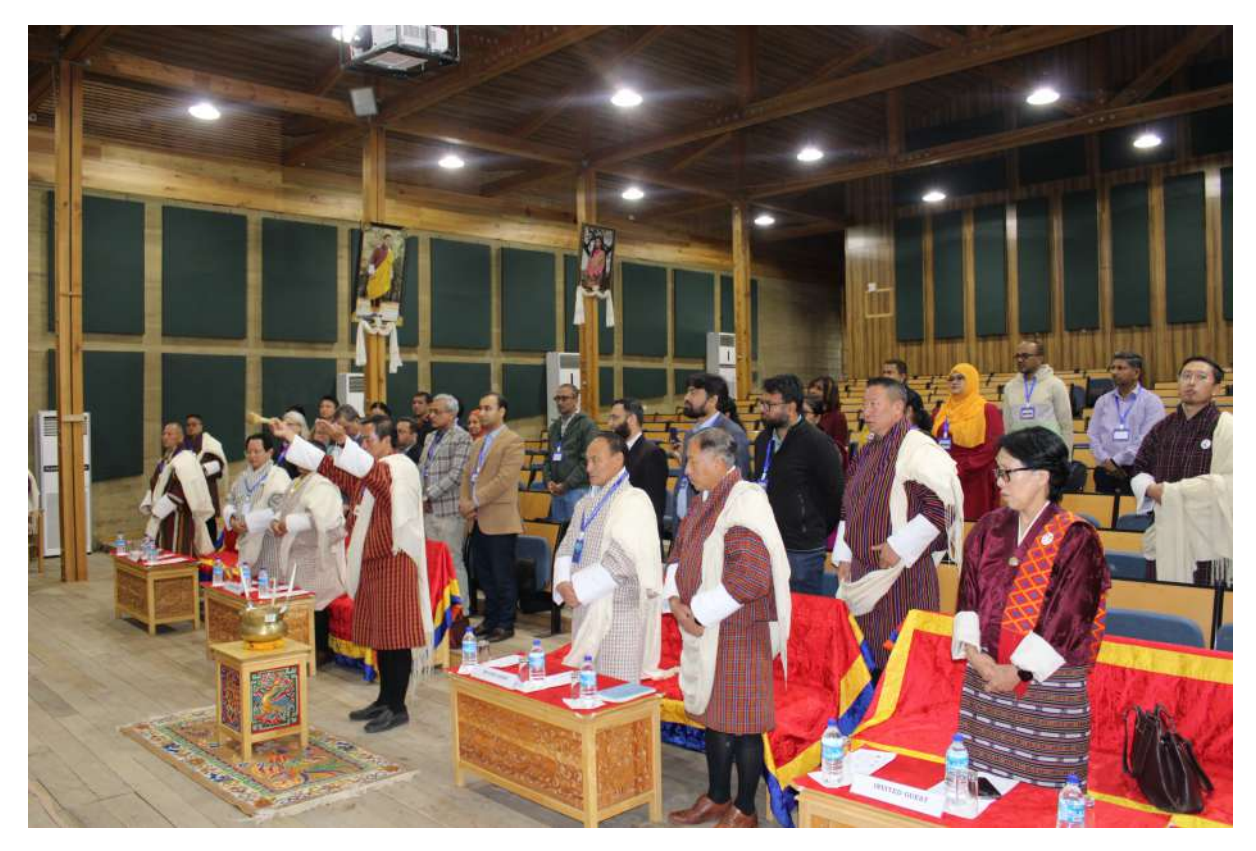
Inaugural Ceremony of the Meeting – Offering Marchang