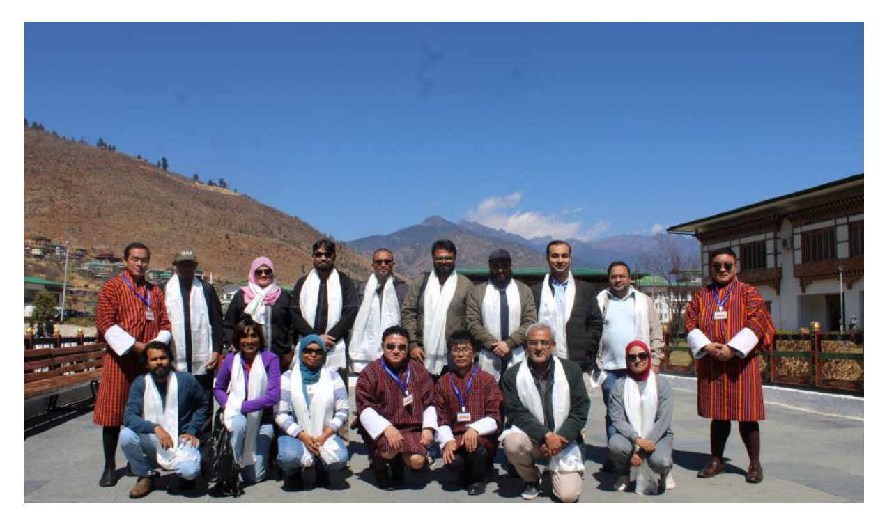
2<sup>nd</sup> Batch Arrival (Maldives & Pakistan) Reception at Paro Airport