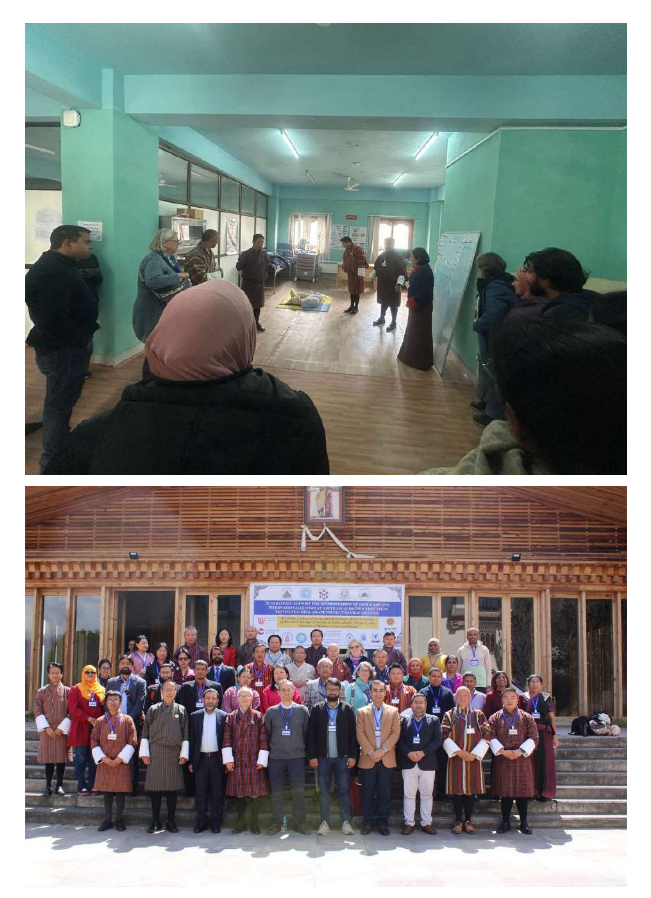
Hon'ble President, KGUMSB, Vice Chancellor, RUB and participants