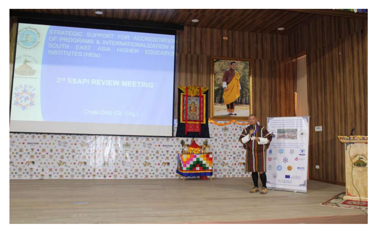
Presentation about SSAPI Project