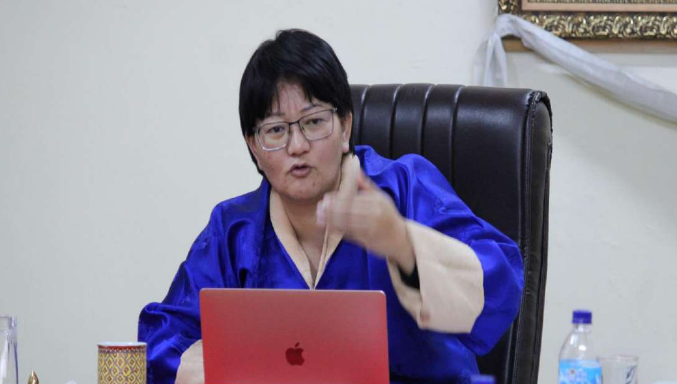
Lyonpo Dechen Wangmo Hon'ble Chairperson University Governing Council (GC)