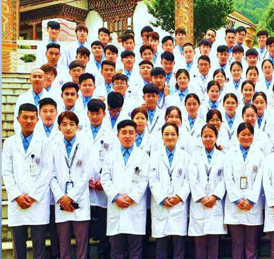
White Coat Ceremony for 2 nd year Medical Technicians, Clinical Counseling, Health Assistant and Emergency Medical Responder students as they embark on their clinical posting after completing one year of Common Foundation course.