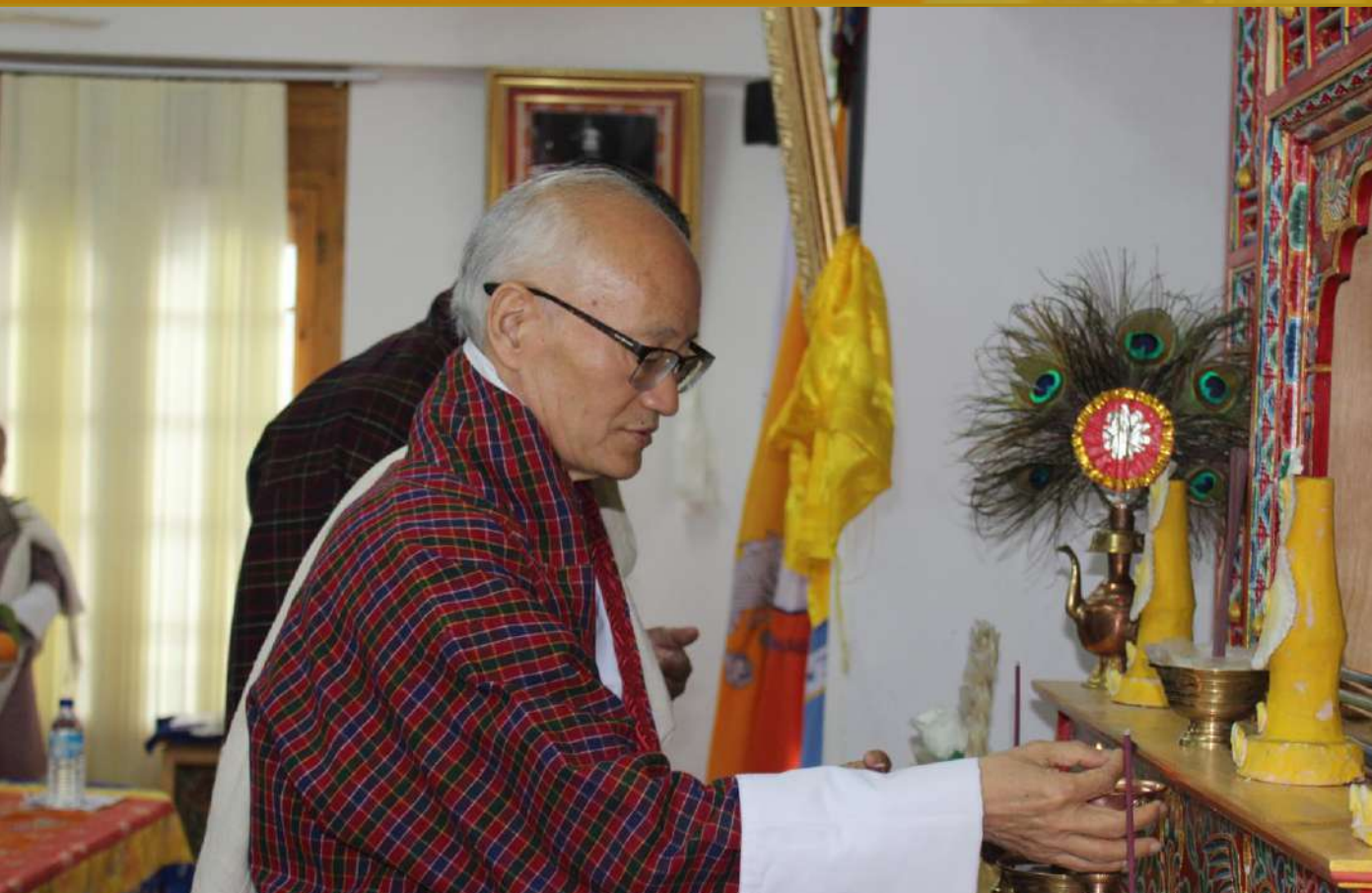
Hon'ble President Lamp lighting during the MoU signing.