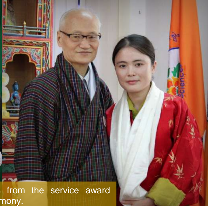
Random pictorial highlights from the service award moments and investiture ceremony.