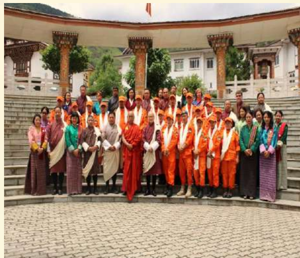
19 Desups took part as a first cohort for this short course.

Understanding the mental health issues in society emerges beyond management, and to resolves those issues, this particular course will be benefiting the country to develop and expanding mental health cadre of workers. Moreover, there are specific objectives such as preventive and promotion of healthy mental health in regional communities, and extend outreach to support local communities and needy ones.