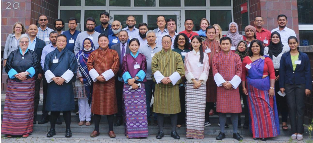
Participants from the various member countries

A four-member delegation from Khesar Gyalpo University of Medical Sciences of Bhutan attended the first International Training and Project Meeting of the project ‘Strategic Support for Accreditation of Programs and Internationalization at South Asian Higher Education Institutes (SSAPI)’ at the University of Bremen, Germany from July 4-15, 2022. The project was funded by the European Union under Erasmus+ Capacity Building in Higher Education.