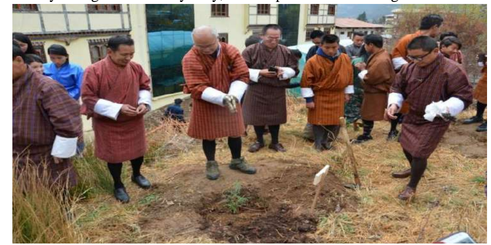
Tree plantation dedicated to His Highness the Gyalsey

campus of Faculty of Traditional Medicine on 6<sup>th</sup> February 2016 led by the Hon'ble President. The day began with the offering of prayers of goodwill followed by plantation of tree saplings by the staff and the students of the University.