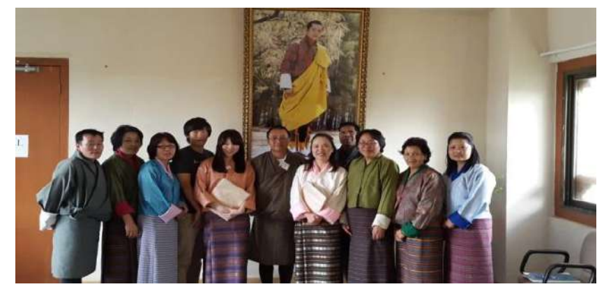
With students and faculty from School of Nursing, Akita University, Japan