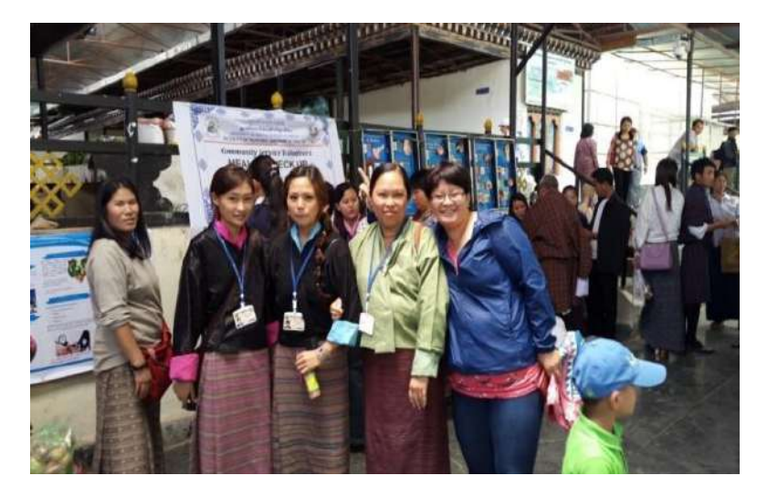
Health Check-up at Centenary Farmers' Market in collaboration with Bhutan Cancer Society