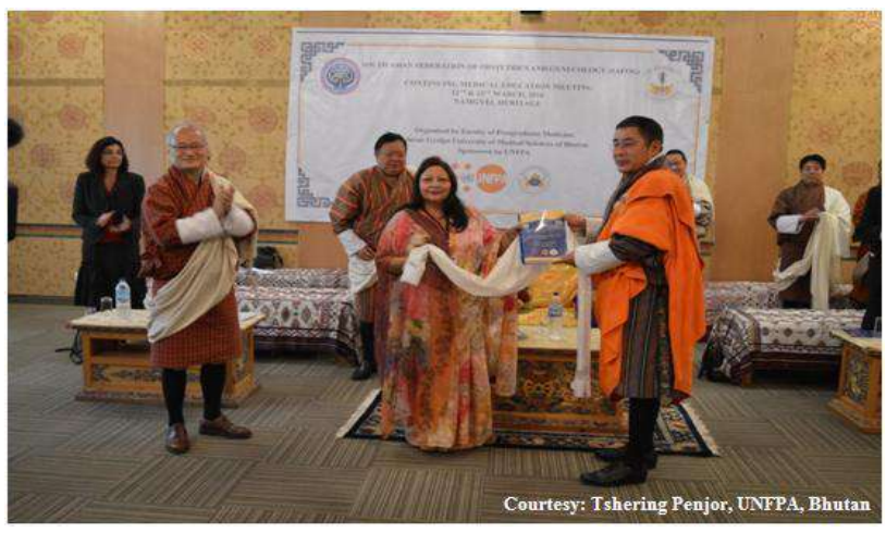
Chief guests with SAFOG delegates

This was attended by over 32 delegates from SAARC countries and 85 Bhutanese consisting of Gynaecologists and nurses involved in birthing and midwifery.