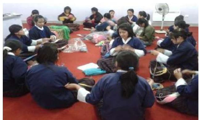
Knitting at FNPH