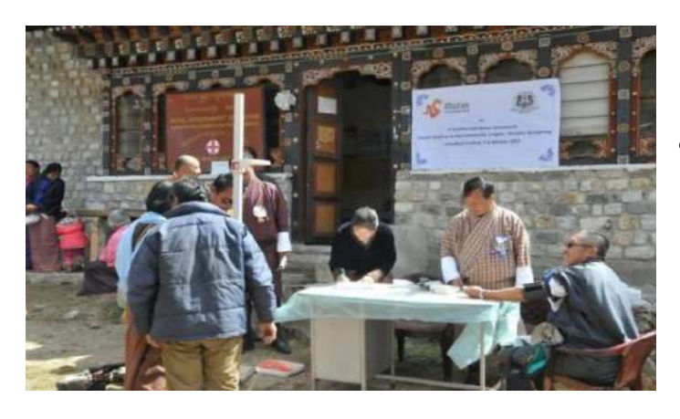
A team visited Soe to conduct Health Check-up during the annual Jomolhari Mountain festival from 7-8 October 2015. The festival and the health checkup was supported the Bhutan Foundation.