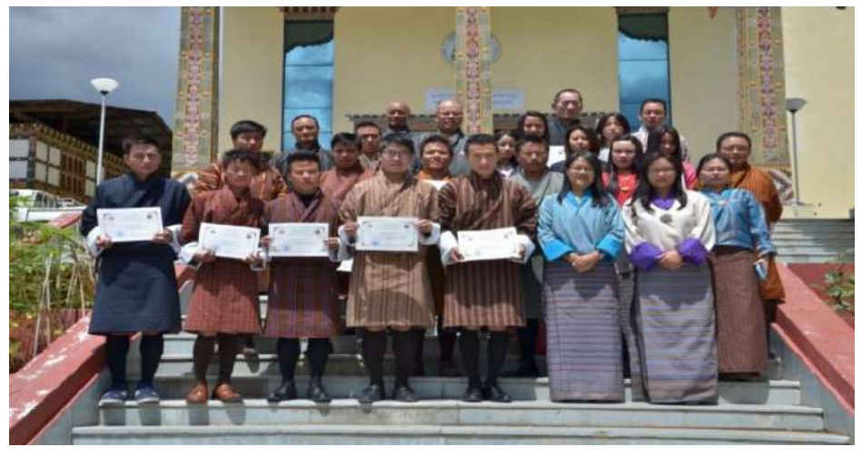
Drungtsho and Menpa Graduates of 2015

Five Drungtsho and ten sMenpa students graduated from the institute in June 2015.