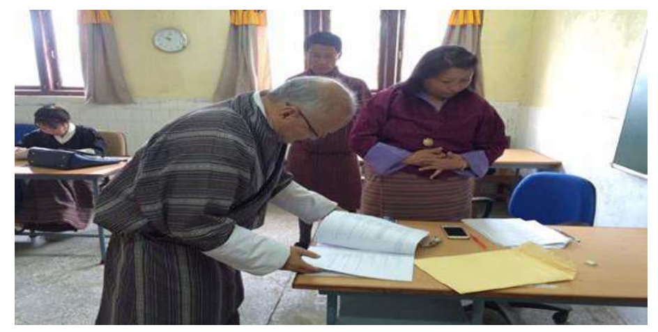
FHon'ble President going through the question paper

The entrance examination for 3rd batch of residents was conducted on 16th May 2016. A total of 12 candidates had applied against 15 which was advertised. slots, However, due to various reasons only 9 appeared for the exams.