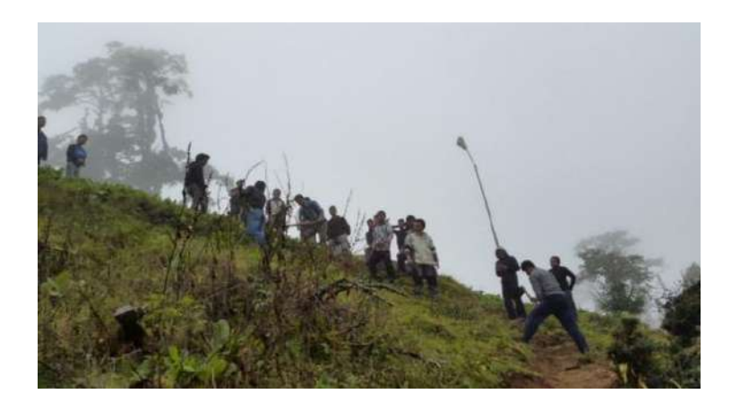
FNPH Students clearing the trail from Dochula Pass to Lamperi Botanical Park for the Move for Health Walk