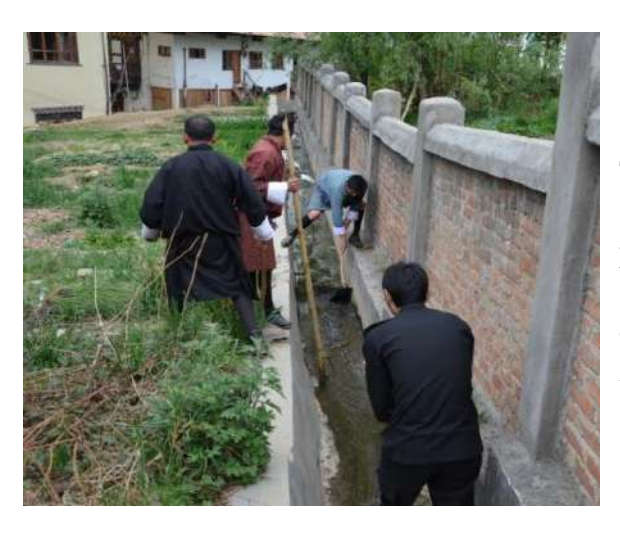
The staff and students of FoTM participated in amass cleaning campaign on 14<sup>th</sup> April 2016.