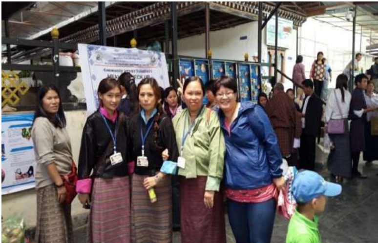
Health Check-up at Centenary Farmers' Market in collaboration with Bhutan Cancer Society