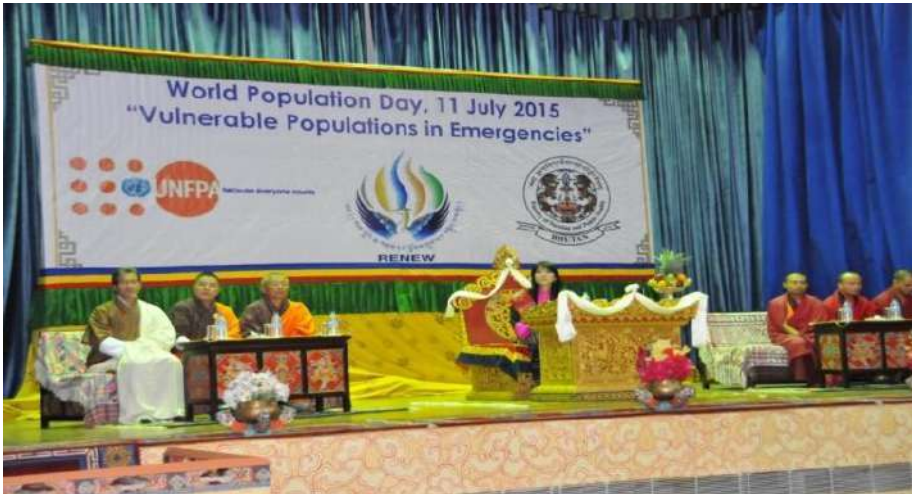
Her Majesty, the Queen Mother Ashi Sangay Choden Wangchuck presiding over the World Population Day Observation

Faculty and students with Her Majesty, the Queen Mother Ashi Sangay Choden Wangchuck, UNFPA Good will Ambassador and dignitaries at the World Population Day observation on 11 July.