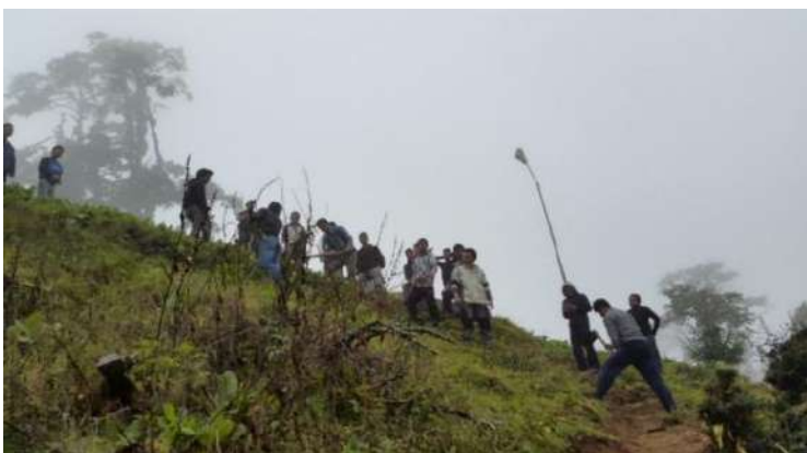
FNPH Students clearing the trail from Dochula Pass to Lamperi Botanical Park for the Move for Health Walk