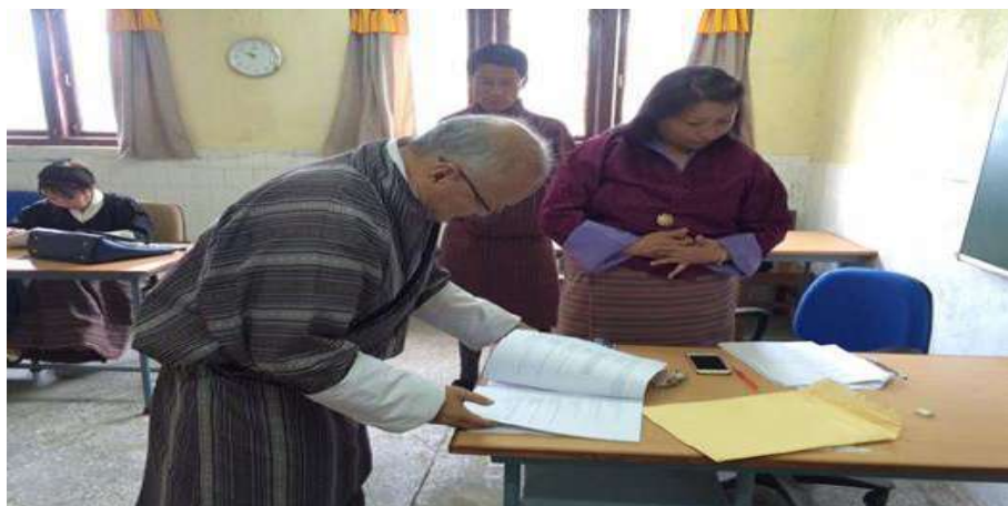
FHon'ble President going through the question paper

The entrance examination for 3rd batch of residents was conducted on 16th May 2016. A total of 12 candidates had applied against 15 slots, which was advertised. However, due to various reasons only 9 appeared for the exams.