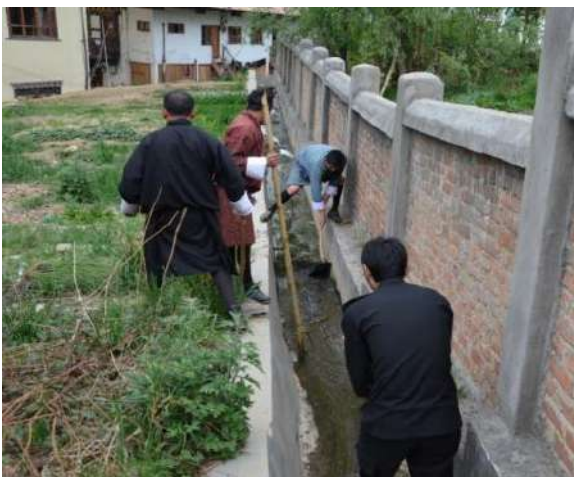
The staff and students of FoTM participated in a mass cleaning campaign on 14 th April 2016.