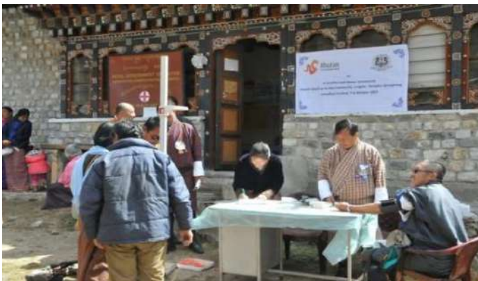
A team visited Soe to conduct Health Check-up during the annual Jomolhari Mountain festival from 7-8 October 2015. The festival and the health check-up was supported the Bhutan Foundation.