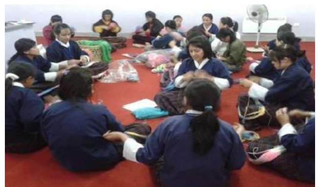
Knitting at FNPH