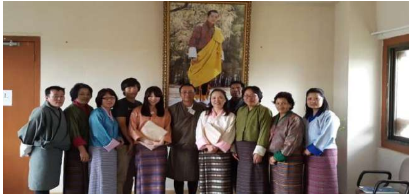
With students and faculty from School of Nursing, Akita University, Japan