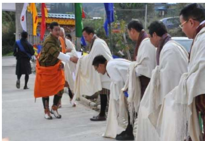
The reception of Chief Guest by Hon'ble President and team

The 1 st International Conference on Medical and Health Sciences 2015 was held from 6 th - 8 th November, 2015 at Convention Hall, Royal University of Bhutan, Thimphu. The Conference was attended by over 300 participants of which 39 were participants from 12 countries across the Globe.