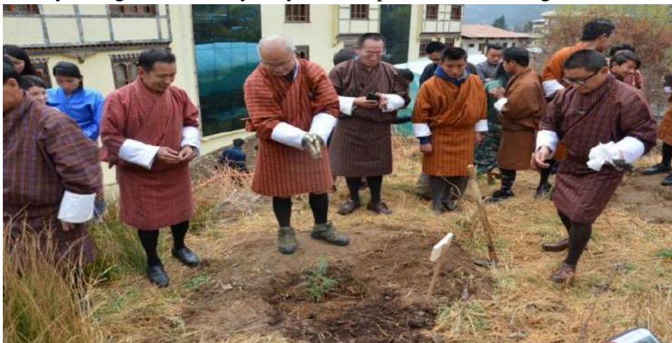
Tree plantation dedicated to His Highness the Gyalsey

To commemorate the birth of His Royal Highness the Gyalsey, a tree plantation was organized in the campus of Faculty of Traditional Medicine on 6 th February 2016 led by the Hon'ble President. The day began with the offering of prayers of goodwill followed by plantation of tree saplings by the staff and the students of the University.