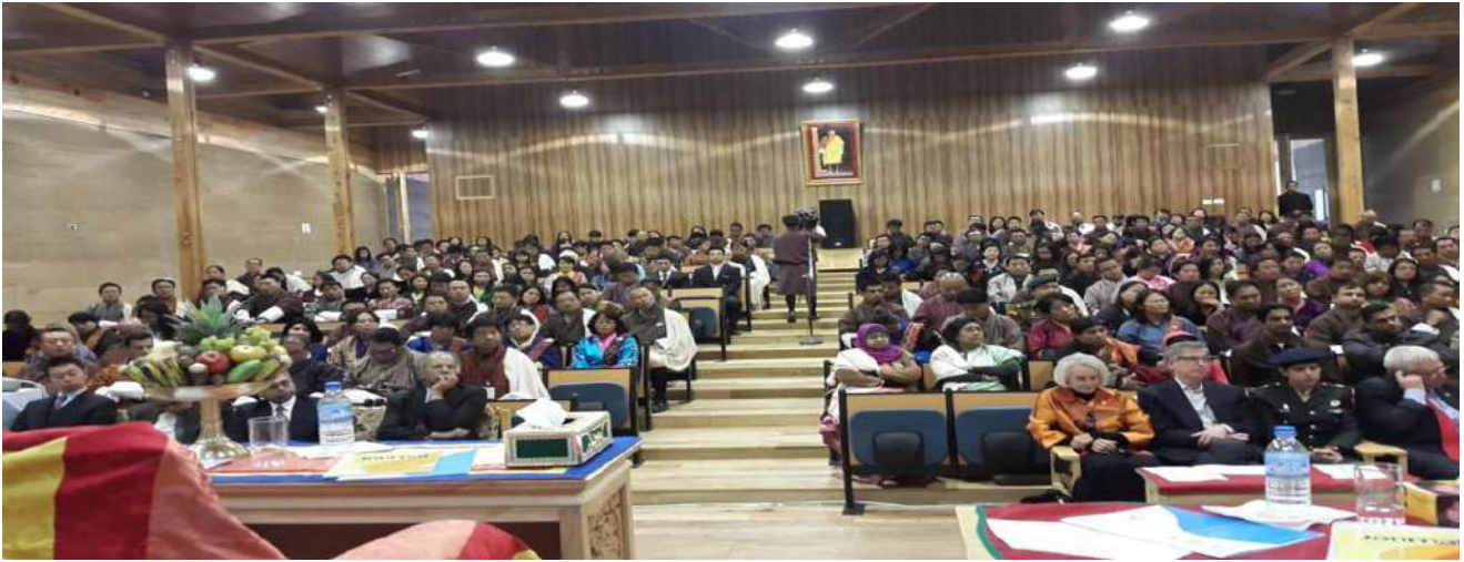
1st International Conference on Medical and Health Sciences

The presentations during the conference comprised of topics from various disciplines of medical field including Health Systems, Traditional Medicine, Tropical Diseases, Clinical and Case reports, Nursing and midwifery and many more areas in Health sciences.