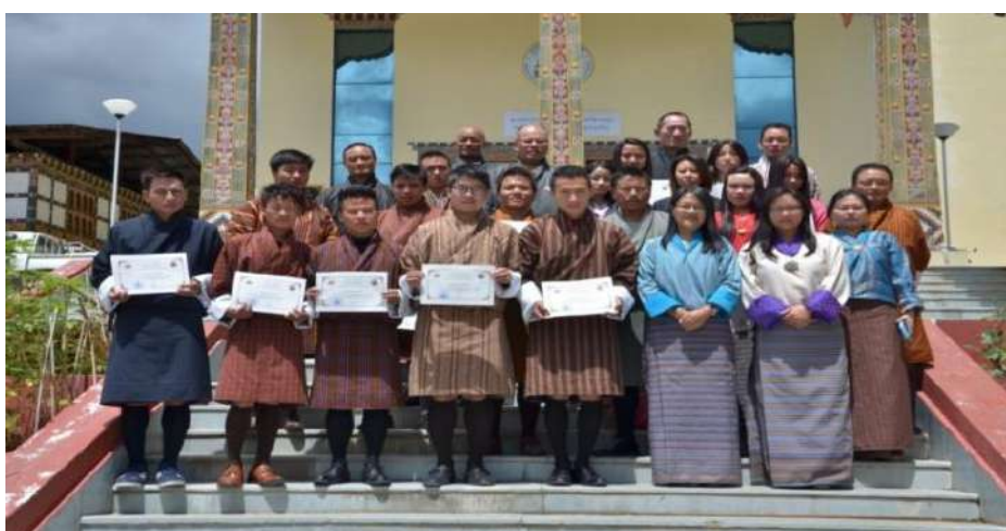
Drungtsho and Menpa Graduates of 2015

Five Drungtsho and ten sMenpa students graduated from the institute in June 2015.